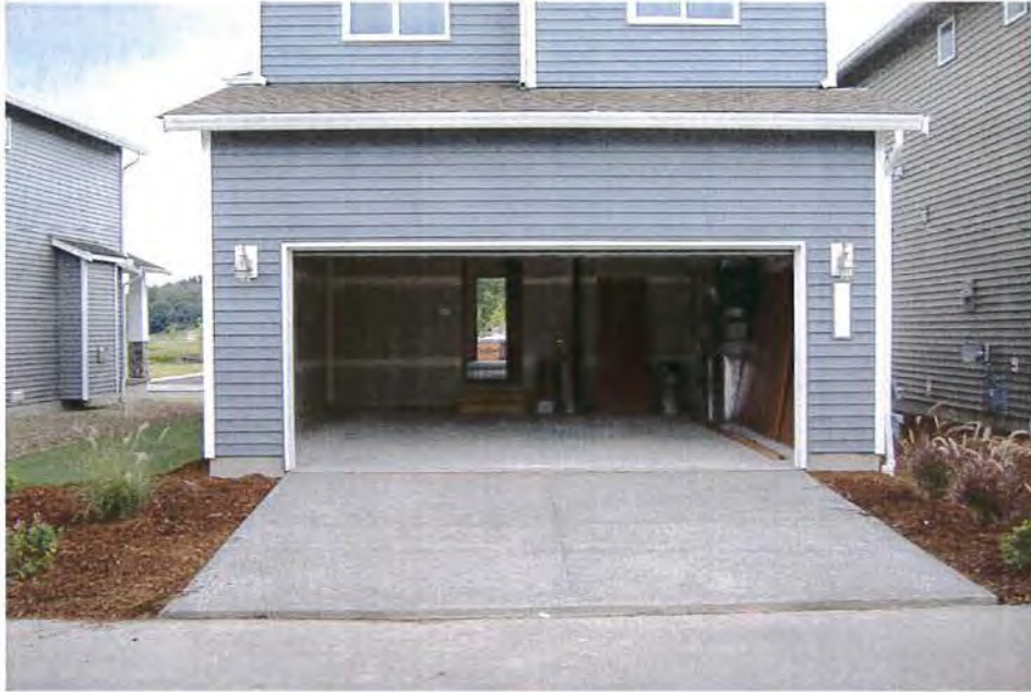
Lot 8 South Face 07-30-08

If submitting more photographs than will fit on the preceding page, affix the additional photographs below. Identify all photographs with: date taken; "Front View" and "Rear View"; and, if required, "Right Side View" and "Left Side View."