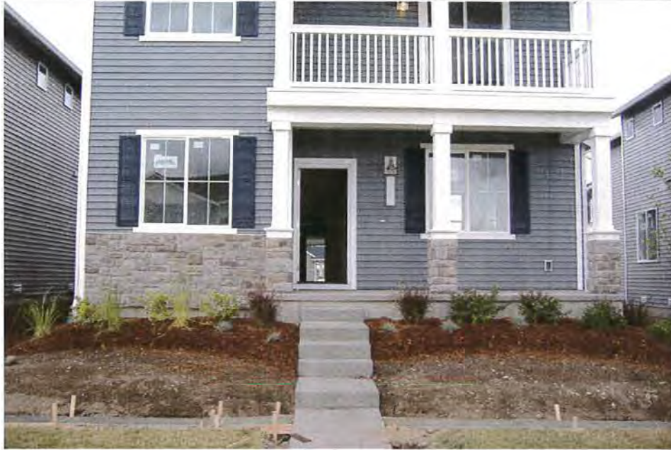
Lot 8 North Face 07-31-08

If using the Elevation Certificate to obtain NFIP flood insurance, affix at least two building photographs below according to the instructions for Item A6. Identify all photographs with: date taken; "Front View" and "Rear View"; and, if required, "Right Side View" and "Left Side View." If submitting more photographs than will fit on this page, use the Continuation Page, following.