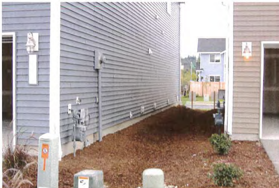
Lot 8 East Face 07-30-08