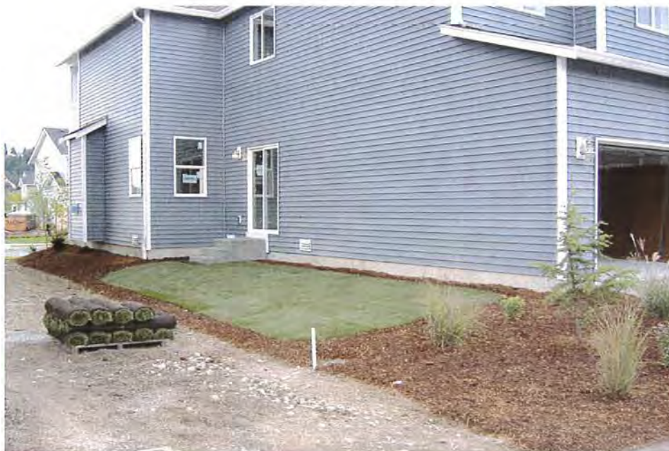
Lot 8 West Face 07-30-08